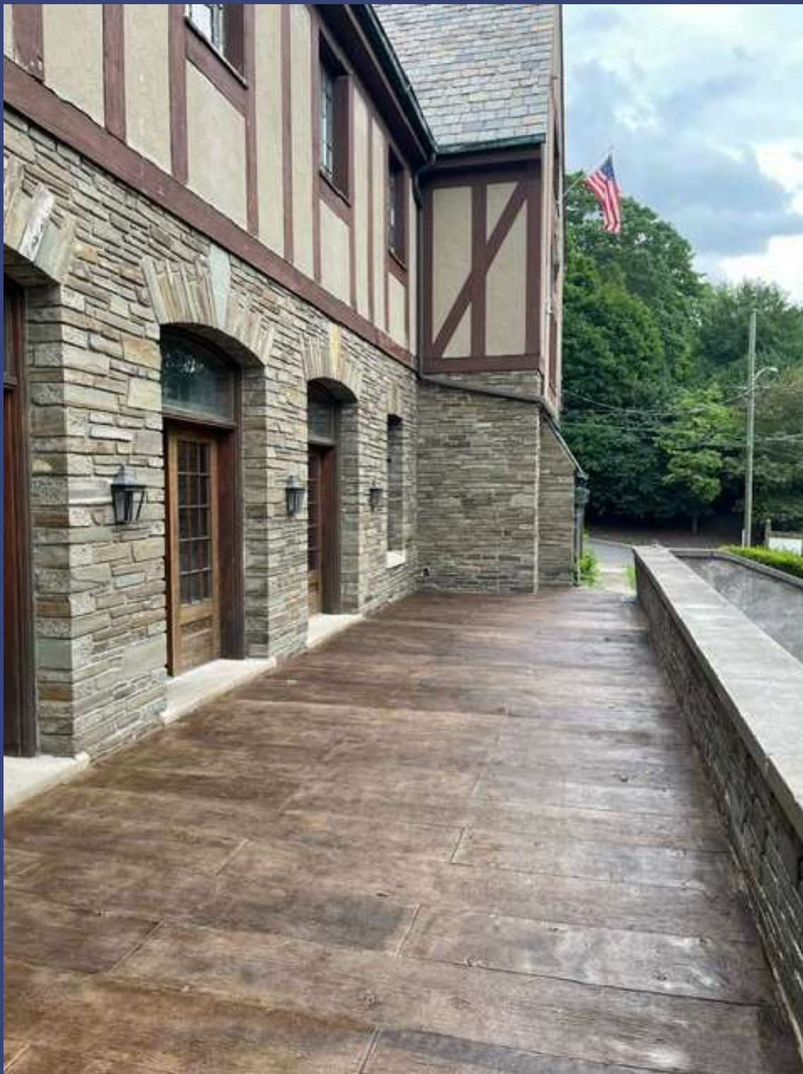
Newly renovated front porch